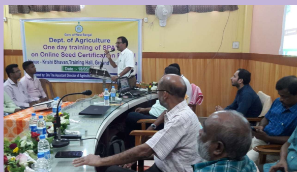
Training for staff at Bankura