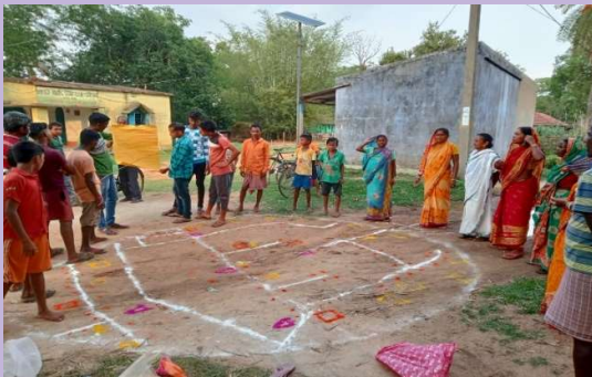
Social mapping in villages