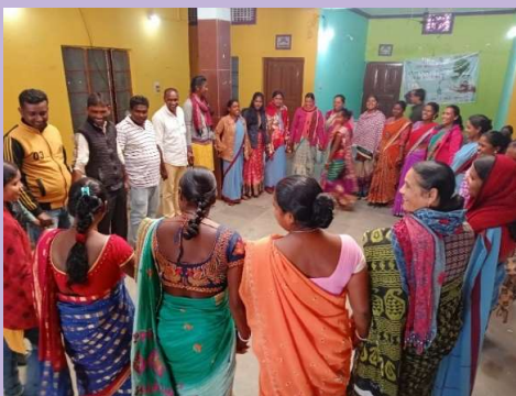
Training of VWSC members and Jal Sahiya