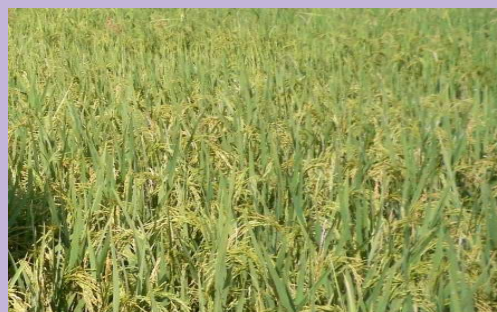
Paddy Seed Production field, Netura and Patharkati