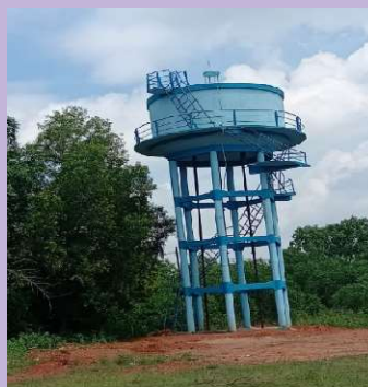
Community Water Tank