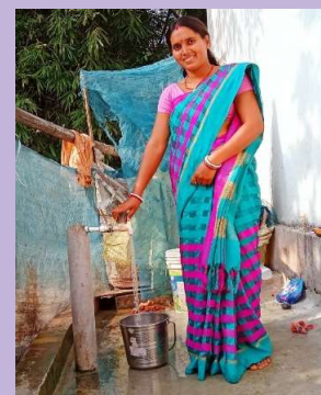
Tap water in village