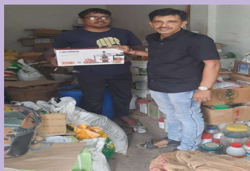
Our Dealer point, Babatta, Purba Medinipur