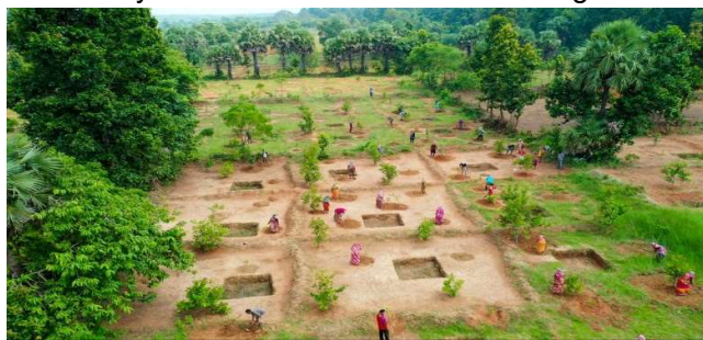
30'x40' with Mix Orchard Field at Andharisol

As this year was the last year of this phase, a kind of recapitulation of the whole journey has been attempted through. In this last 4 years, the project has touched more than 11000 Household through its benefit as well as nearly 7000 ha area has been brought under treatment. Soil erosion could be checked in 3069.27 ha area. There are huge areas still to be brought under treatment through effective implementation of UM compliant activities. More than 1000 ha has been brought under UM compliant work in forest area though there is still vast area in Jhargram block has to be taken under water recharge and harvesting activities. Nearly, 3000hecter meter runoff water has been arrested in these years' activities. Permanent vegetation has been created in 1620.42 ha area. 503.1 ha-meter water has been restored in WHS. Per capita water harvesting potential has been created as 261.67 cu-meter water. 5030.96 ha area has been