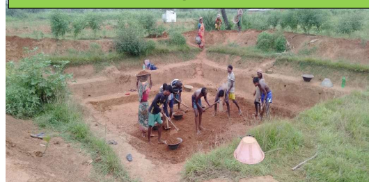
5% Model (Hapa) WH Structure

As this year was the last year of this phase, a kind of recapitulation of the whole journey has been attempted through. In this last 4 years, the project has touched more than 11000 Household through its benefit as well as nearly 7000 ha area has been brought under treatment. Soil erosion could be checked in 3069.27 ha area. There are huge areas still to be brought under treatment through effective implementation of UM compliant activities. More than 1000 ha has been brought under UM compliant work in forest area though there is still vast area in Jhargram block has to be taken under water recharge and harvesting activities. Nearly, 3000hecter meter runoff water has been arrested in these years' activities. Permanent vegetation has been created in 1620.42 ha area. 503.1 ha-meter water has been restored in WHS. Per capita water harvesting potential has been created as 261.67 cu-meter water. 5030.96 ha area has been