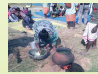
Preparing organic pesticides