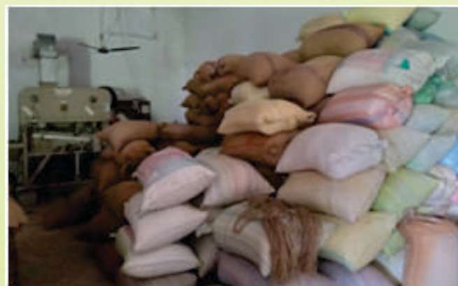
Stock of Raw seeds in Godown

Market - Market have been developed in Paschim Medinipur, Purba Medinipur , Purulia District and in the nearest market of Jharkhand and Orissa state. Approximately 176 ton seeds were sold in this year.