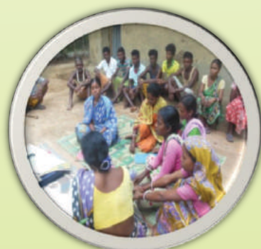
Micro Planning Meeting

Family based micro planning exercise was done before kharif season in all of 13 target villages with group members and their males for preparation of land pattern based crop list and estimated cost of cultivation. Total 18 nos. of such livelihood planning exercise was done, 13 such exercise for kharif season and 5 exercises for rabi season. Through this process list of SRI, vegetables for kharif and rabi season and oilseed were prepared.