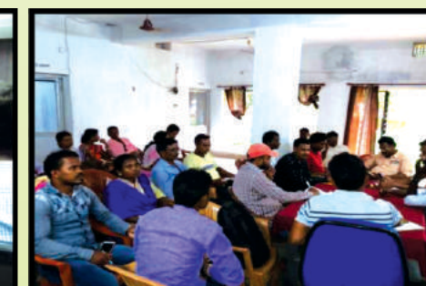
District Coordination Committee Meeting in DC Office, Jamshedpur and Block level Coordination Committee Meeting, Dhalbhumgarh.

4. Project Title: Building Dhalbumgarh, East Singhbhum district in Jharkhand as a driver for regional growth while transforming quality of life of 6,000 households under the Central India Initiative.- Supported by Cini and Tata Trusts.