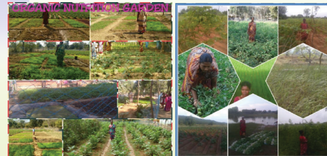
Organic Nutrition Garden and different crop cultivation under MKSP