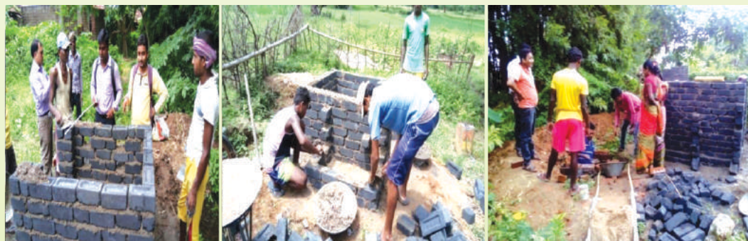
Trainings were also organized for masons who would be involved in construction of toilets

From 13-Dec-2017 wall writing for highlighting of WATSAN program started. Writing on 18 walls was completed at the villages Behera, Chukripara, Dudhpusi, Mohisadhora, Roghunathdhi, Junboni, Moudhashuli, Chirugora, Bhadua