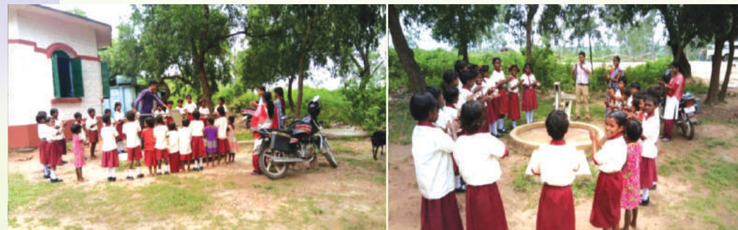
Hands wash training by RDA at Jairamdih School, Junboni, Dhalbhumgarh.