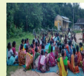
Awareness Camp at Village Level

RDA organised 20 training with farmers on non-chemical based medicine, fertilizer (7), PoP of SRI, Mustard, vegetables (11) and goat rearing (2). Total 217 farmers were trained on the mentioned areas. 4 no. of awareness camp organised at village Baraparua, Darbarmela, Dahi and Saigeriya. 177 farmers participated in the camps. 5 nos. non-chemical based demonstration plot have been developed for internal exposure and training. Out of this, 2 plots are for vegetable cultivation at Nidata and Suknakhali village and others 3 plots are for SRI at Lakhiyasole, Nischintapur and Baraparua village.