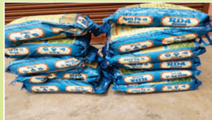
Processed and Packeted seeds for market