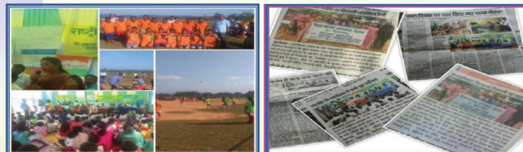
Annual sports and Meet of children. Media coverage of different children initiatives.

● Child club and Children group representatives met with different authorities like BDO (Block development Officer), Mukhia (panchayat head), Zila parishad member of PRI, Block level Child Line in-charge and 2nd officer of Ghatsila Police Station and submitted 12 numbers of demand like providing safe room in school for running child club programme, school boundary, supply of plants, tube well for safe drinking water, electric line in Choroigora school, new pond, pond renovation and providing some sports materials etc. Out of the 12 demand, 6 demands (50%) have been fulfilled. Through quarterly health check up and treatment camps in child club all 275 children club members were covered. Through those camps MBBS doctor of RDA built awareness of children and their mothers on maintenance of better health of the children by cleanliness, consumption of numbers of green vegetables and local fruits and timely health check up of children.